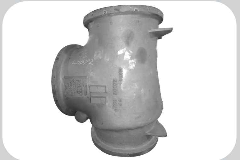
Valve Body Casting In Duplex Steel