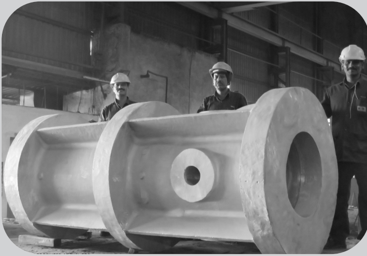
Largest Stainless Steel Casting Produced (Weight: 8.8 MT)