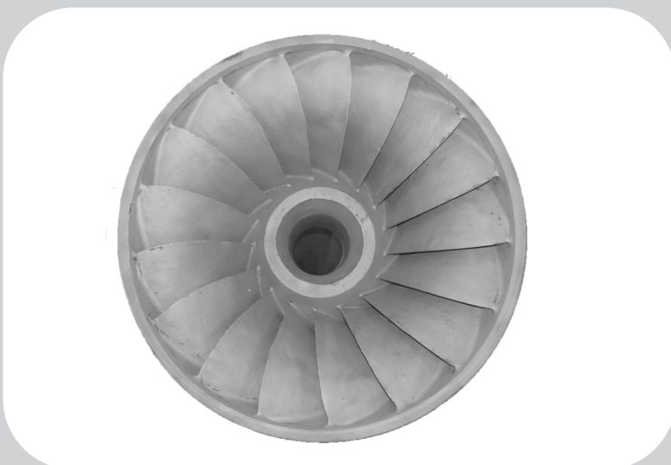
Francis Runner Casting Manufactured With 3D Print Core (Weight : 2.2 MT)