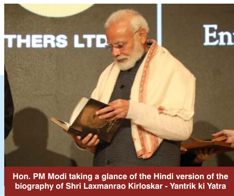
Hon. PM Modi taking a glance of the Hindi version of the biography of Shri Laxmanrao Kirloskar - Yantrik ki Yatra