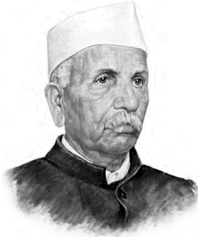
Laxmanrao Kashinath Kirloskar (1869-1956) Founder, Kirloskar Brothers Limited

“ Treat your work as your duty. He who works earns the world’s respect. So immerse yourself completely in work if you want to succeed in the world. ”